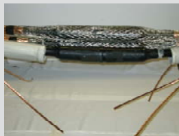
Joint body shrunk down