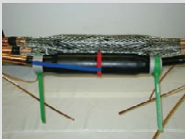
Joint body in position