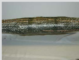
Outer stocking braid in position