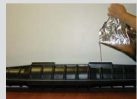
Pouring of polyurethane resin