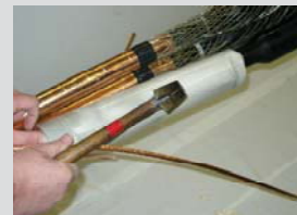
Cracking of self eject carrier