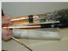
Removal of carrier