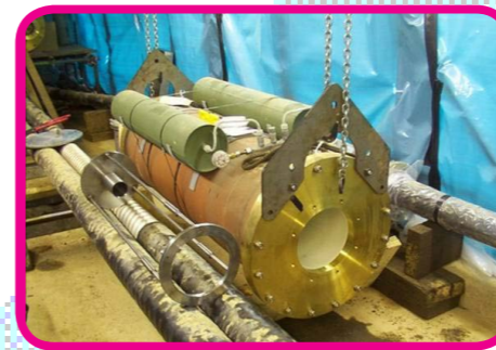
400kV Stop Joint - In Assembly