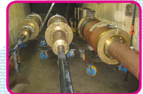
275kV Transition Joints - Terna Rome