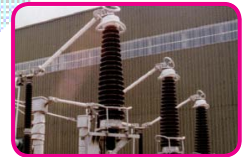
400kV Outdoor Terminations