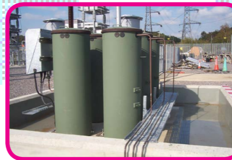
Outdoor Tank Farm