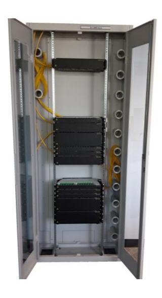
*Note – picture above shows the rack with a partial upgrade kit installed